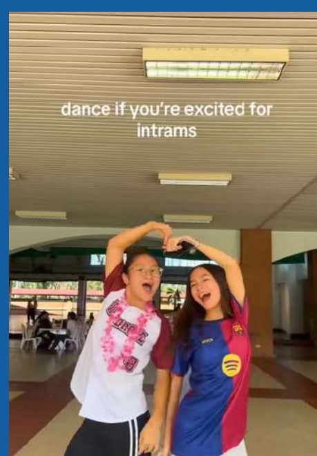
Family Day Tiktoks