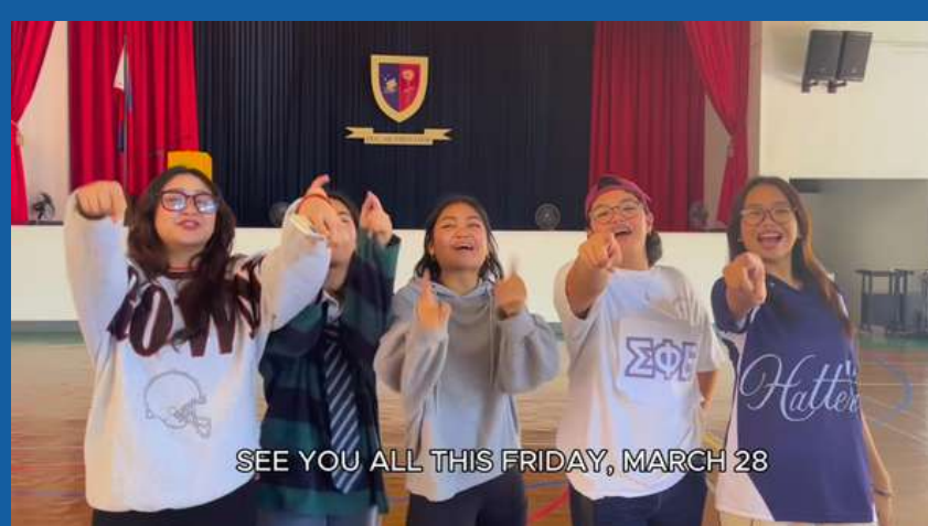
Spirit Week Reels