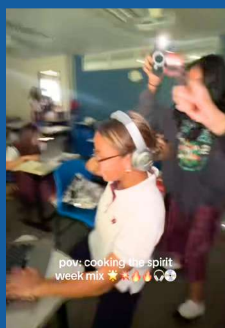
Spirit Week Tiktoks