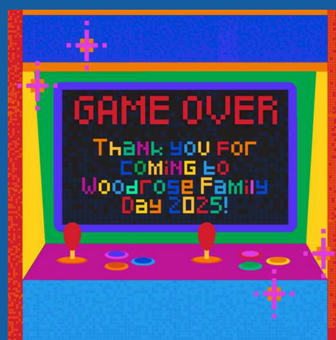
Family Day Pubmats