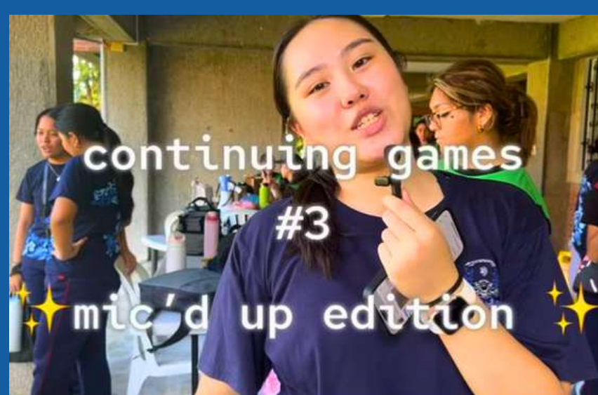
Family Day Reels