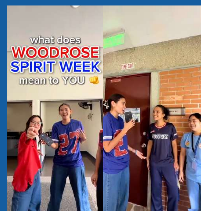
Spirit Week Interviews