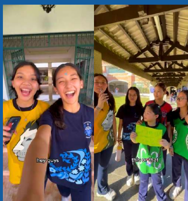
Family Day Interviews