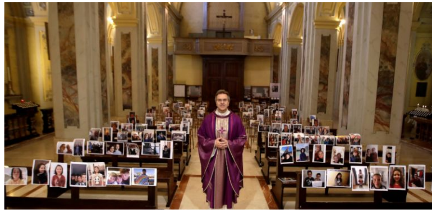
An Italian priest taped photos of his parishioners onto empty pews during the lockdown.

The Cardinal clarified that although the streamed masses and other celebrations where helpful, "No broadcast is equivalent to personal participation, nor can it substitute for that participation."