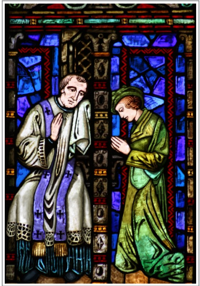
A stained glass window illustrating the sacrament of Confession.

rid myself of the spiritual mediocrity, the spiritual indifference that I find myself in so much of the time? Is there something I can give up? Is there something in my life right now that is not pleasing to Almighty God? Is there some sin that I am holding on to? Is there some habitual sin that is separating my heart from God's loving grace? Is there something I need to confess? Am I crucifying Our Lord all over again by living in my sins? Here is a link for a more detailed examination of conscience: https://www.ewtn.com/library/prayer/examconscience.html