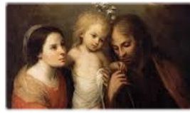
MARCH 20 SOLEMNITY OF ST. JOSEPH