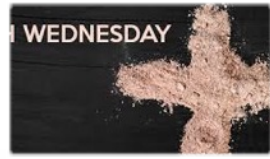
MARCH 1 ASH WEDNESDAY