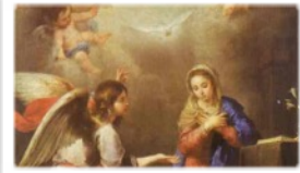
MARCH 25 THE ANNUNCIATION OF THE LORD